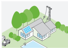
Residential grid-tie solar with backup power